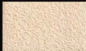
Santa Fe Tan